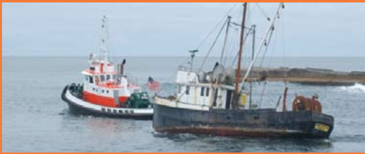
Deep Sea Fishing Charter