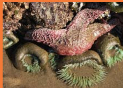
Oregon's Best Tide-pooling