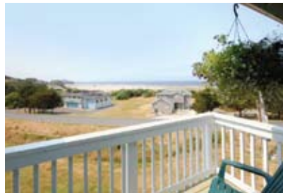
Inn At Face Rock